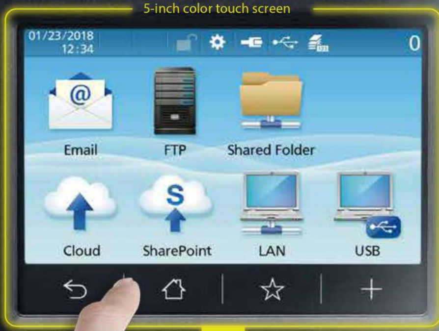
5-inch color touch screen

With the addition of the mounted 5-inch color touch screen on the scanner, users can adjust the settings from the touch panel and have a quick and easy access to the most used scanning operations. By selecting the desired operation from the menu, users can easily send scanned images or data via various destinations such as email.