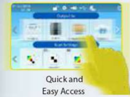
Quick and Easy Access

*The image shows the actual size of the touch screen.